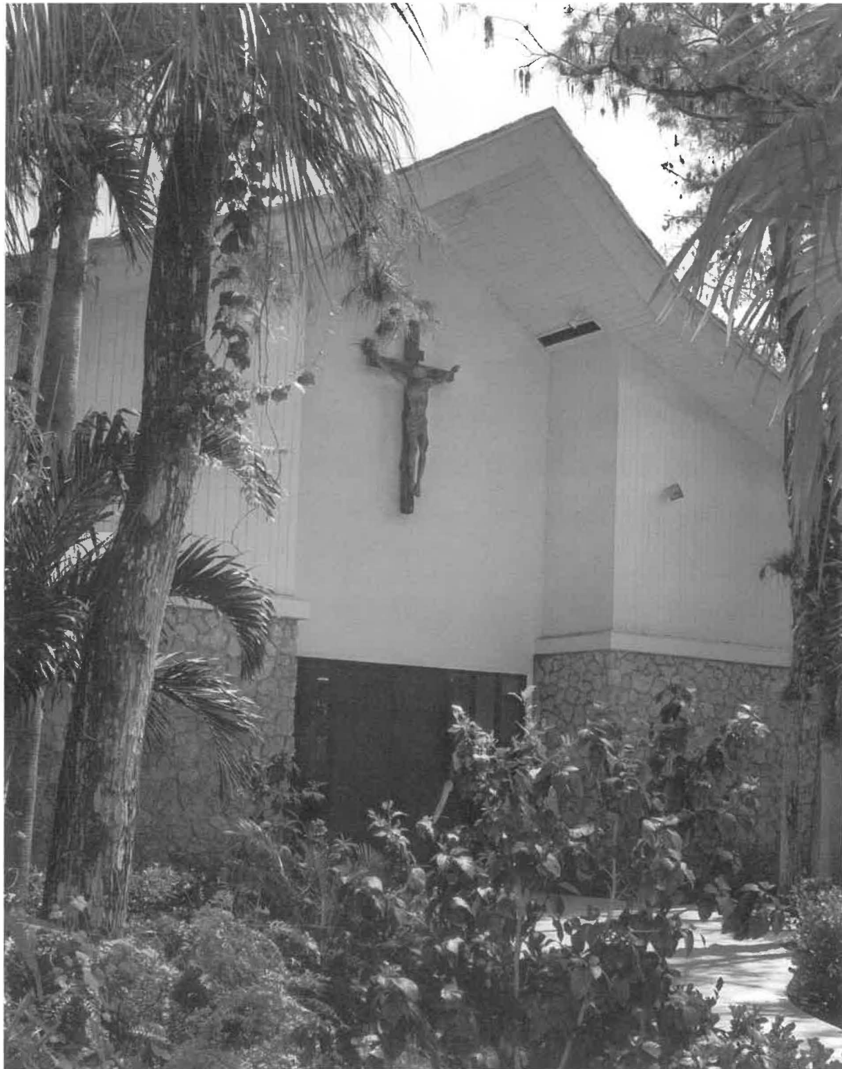
St. Mary Magdalene Church, Coral Springs, Fla.

AN INDEPENDENT WEEKLY SERVING EPISCOPALIANS ♦ July 16, 2000 ♦ $2.00