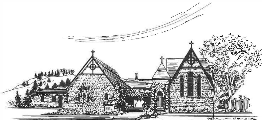
Emmanuel Church, Rapid City, S.D.

KEY — Light face type denotes AM, bold face PM; add, address; anno, announced; A-C, Ante-Communion; appt., appointment; B, Benediction; C, Confessions; Cho, Choral; Ch S, Church School; c, curate; d, deacon, d.r.e., director of religious education; EP, Evening Prayer; Eu, Eucharist; Ev, Evensong; ex, except; 1S, 1st Sunday; hol, holiday; HC, Holy Communion; HD, Holy Days; HS, Healing Service; HU, Holy Unction; Instr, Instructions; Int, Intercessions; LOH, Laying On of Hands; Lit, Litany; Mat, Matins; MP, Morning Prayer; P, Penance; r, rector; r-em, rector emeritus; Ser, Sermon; Sol, Solemn; Sta, Stations; V, Vespers; v, vicar; YPF, Young People's Fellowship. A/C, air conditioned; H/A, handicapped accessible.