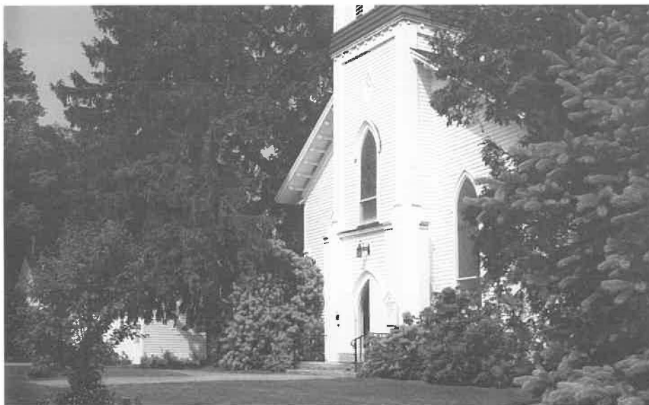
Christ Church, Roxbury, Conn.

A Church Services listing is a sound investment in the promotion of church attendance by all church people, whether they are at home or away. Write to our advertising department for particulars and rates.