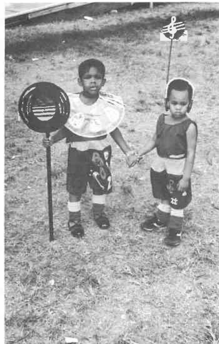
Children wear Carnival costumes in Trinidad.