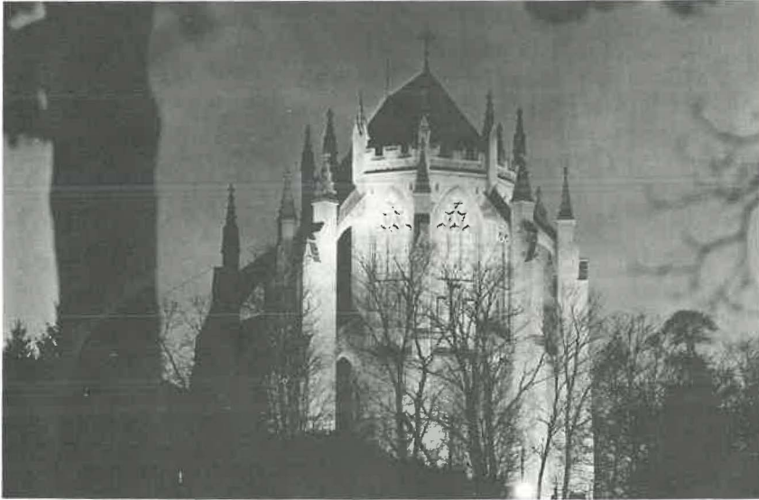
Washington Cathedral: Breathtaking views in documentary.