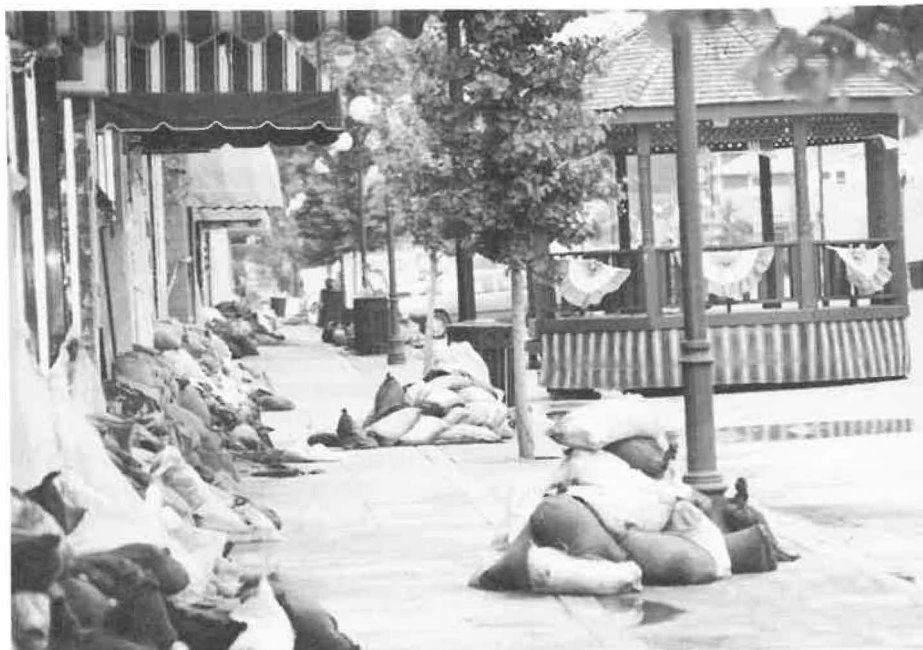
Sandbags line a street in West Des Moines.