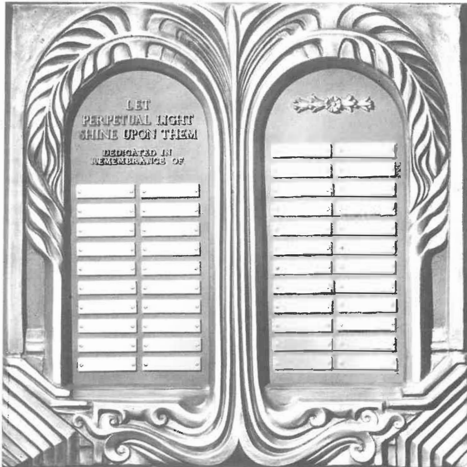
In Remembrance "...let perpetual light shine upon them..."