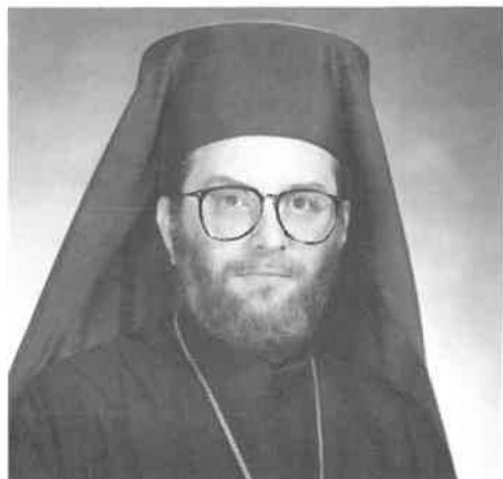
Bishop Basil: Bearing Witness