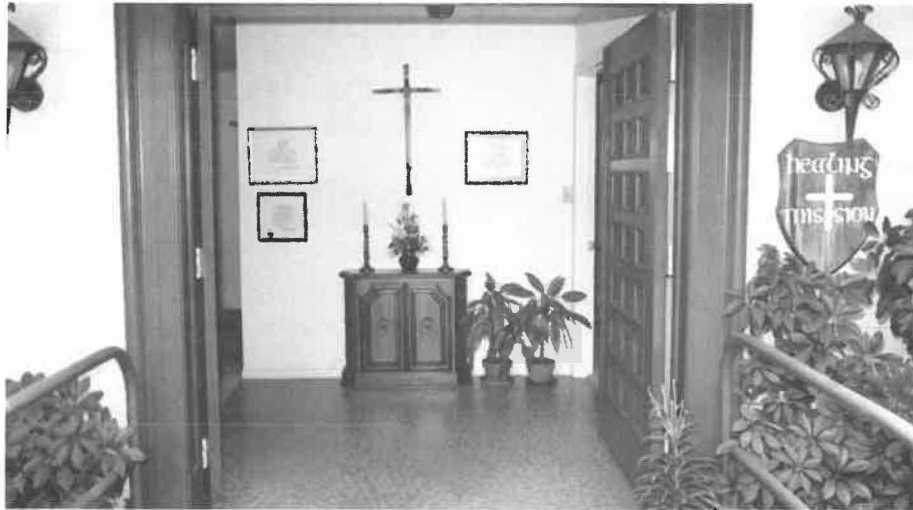
St. Boniface Healing Mission: "no crutches on the wall."