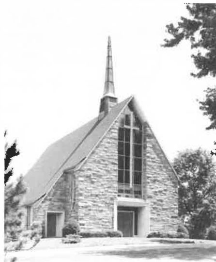
Church of the Transfiguration Silver Spring, Md.