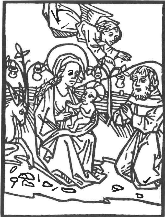
A German wood engraving of the Nativity (circa 1490)