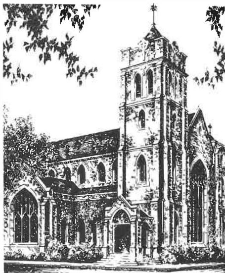
St. Andrew's Church, Fort Worth, Texas