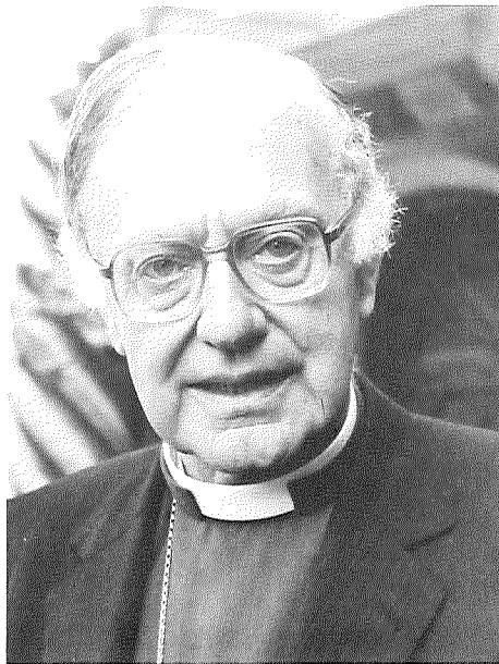
Dr. Runcie: "... restrictions on our communion."

might harm relations with the Episcopal Church, Dr. Runcie said, "It certainly places restrictions on our communion, but surely does not render us out of communion."