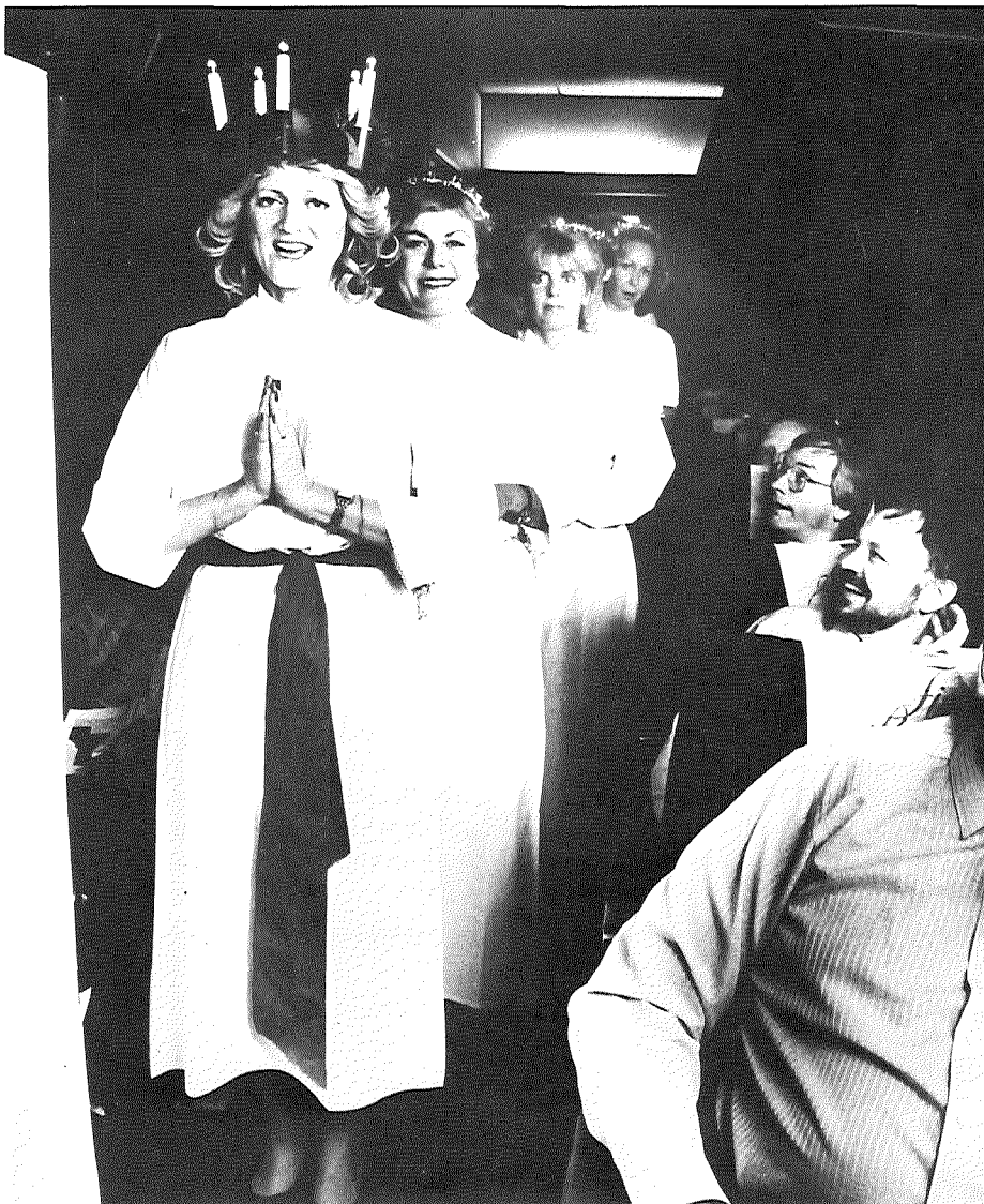
Scandinavian-bound flight attendants have a special wake-up call for passengers on the morning of December 13, as they perform the same Lucia ritual that takes place concurrently in thousands of Swedish homes.

and gave them to him. Another version has her persecutor tearing out her eyes and having them miraculously restored. From the popular devotion to Santa Lucia comes the phrase, "Lucy-light, shortest day, longest night." Her Acts , which most historians find dubious, recounts her last words to the proconsul who says to her, "Words are well till we come to strokes," as being, "Till and after, the words of God can never cease." Declaring herself God's handmaiden, she died.