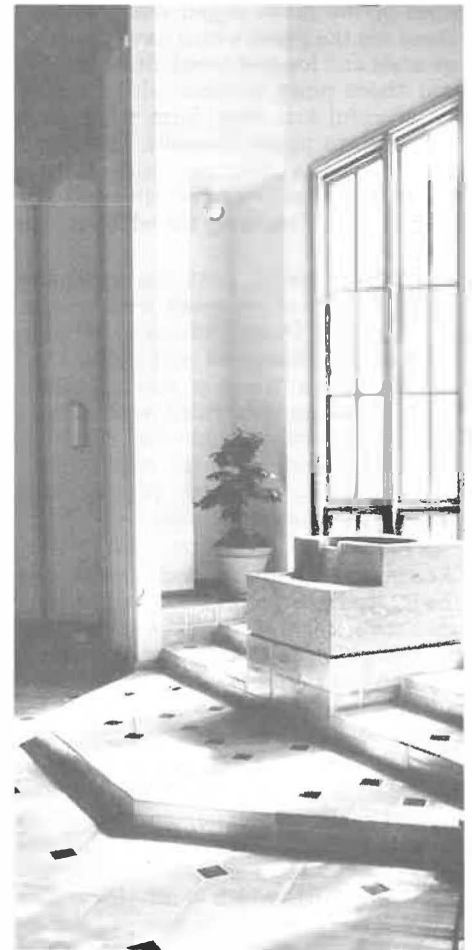
Cold spring granite baptismal font.

The success of the new church is seen as a particularly happy demonstration that the open participation of a community, in partnership with professionals, can produce a building that is sensitive to its time and place.