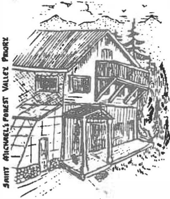
SANCTI MICHAEL'S FOREST VALLEY PROVERB

RETREAT SEASON June 12 - September 15 1983