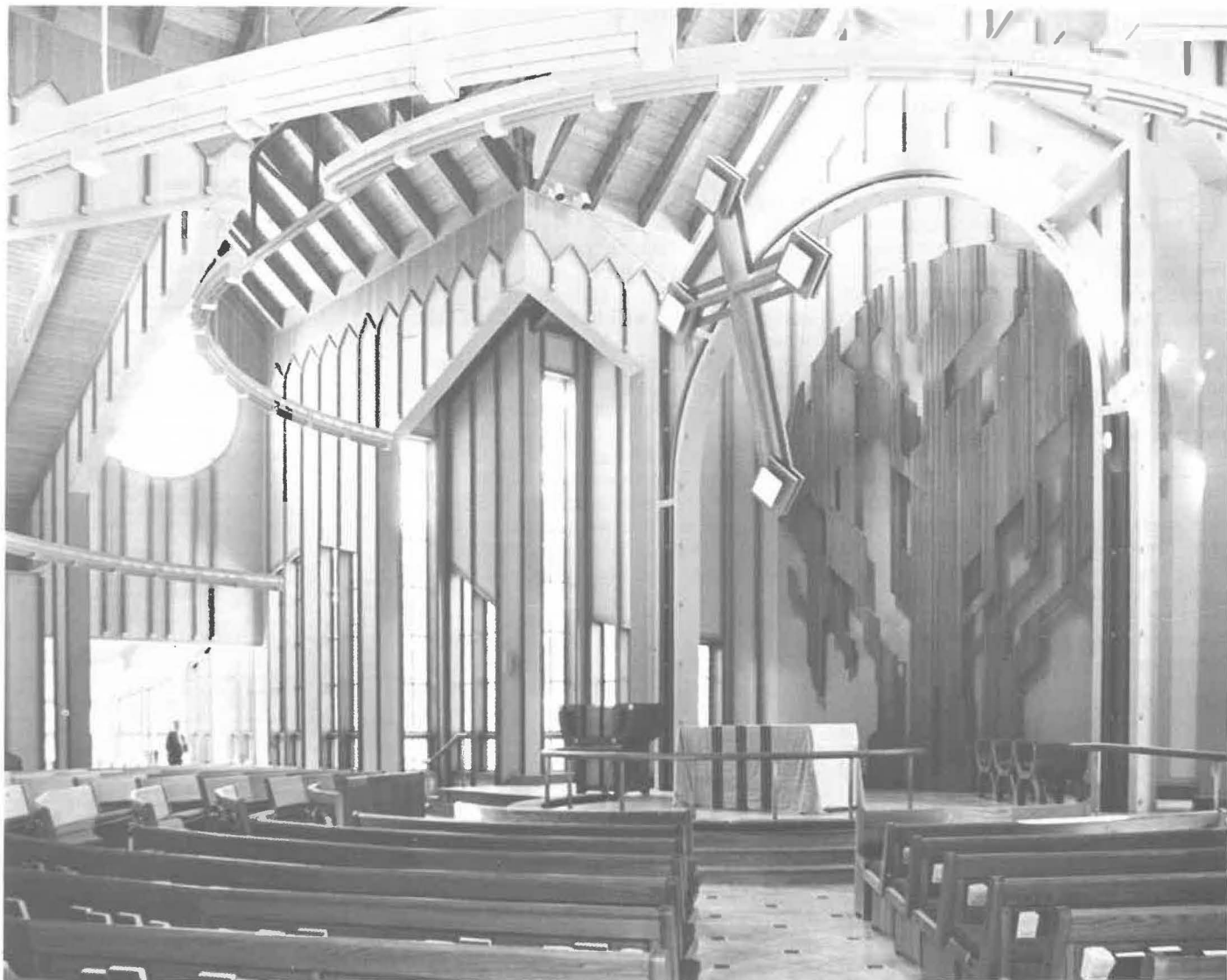
St. Matthew's Church, Pacific Palisades, Calif.: 10,000 hours of planning [p. 10].