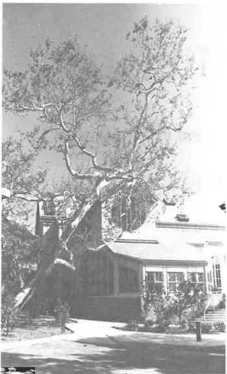
Exterior of St. Matthew's Church, Pacific Palisades, Calif.