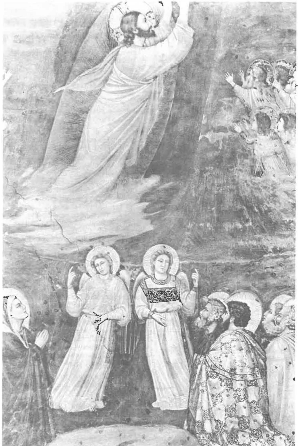
Ascension of Christ, detail of a fresco by Giotto (c. 1266-c. 1337) in Scrovegni (Arena) Chapel, Padua, Italy.