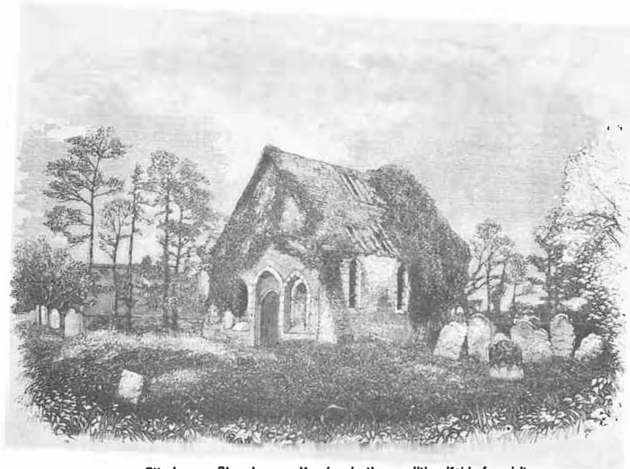
Otterbourne Church, near Hursley, in the condition Keble found it.