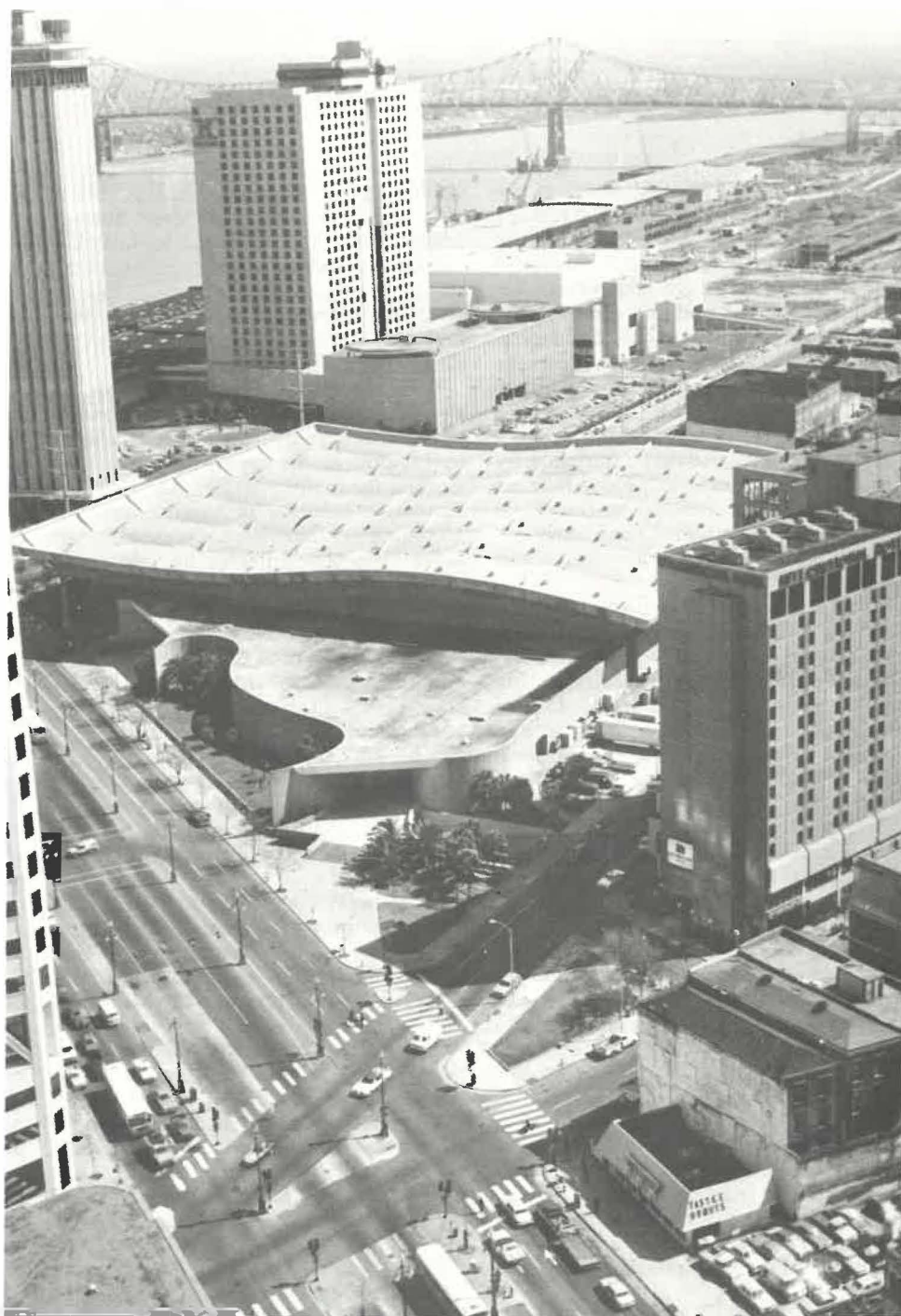
The Rivergate Convention Center, New Orleans (low building in center of photo), site of the House of Deputies sessions: A unique event (p. 11).