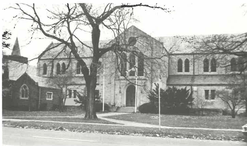
Trinity Cathedral, Trenton, N.J.

ST. STEPHEN'S 2750 McFarlane Road Sun MP & HC 8, HC 10 & 5; Daily 7:15