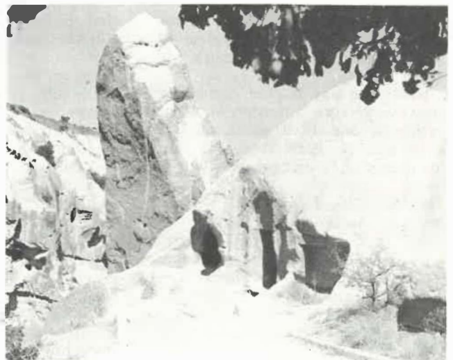
Church of St. Barbara, Goreme Valley, Cappadocia.

Weirdest of all and still charming is the economy of the region. The local economy rests on pigeons. More correctly, it rests on pigeon dung. As they have for centuries, flocks of pigeons produce the manure which is gathered by the vine growers. White wine is a Cappadocian specialty. Think of the birds of the air; how simply and naturally they enrich the grapes that give the wine that gladdens the heart!