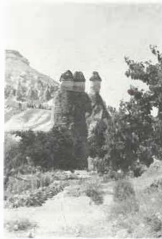
Left: "Fairey chimneys" in rare triple formation, Cappadocia; right, Apartment houses in Cappadocia.

The renegade Christians, you understand, produced impressive underground art. Strong and simple in red clay hues were the singular frescos which I saw adorning Goreme Valley cave churches. They are, like the culture they illustrate, not only odd, but otherworldly.