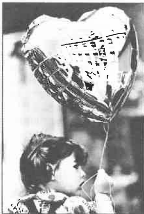
Church School Missionary Offering Advert 1981-1982

"Gifts of Love: the Children and the City" is the theme of the 1981-82 Church School Missionary Offering, which will be used for the support of Episcopal Church programs in urban areas.