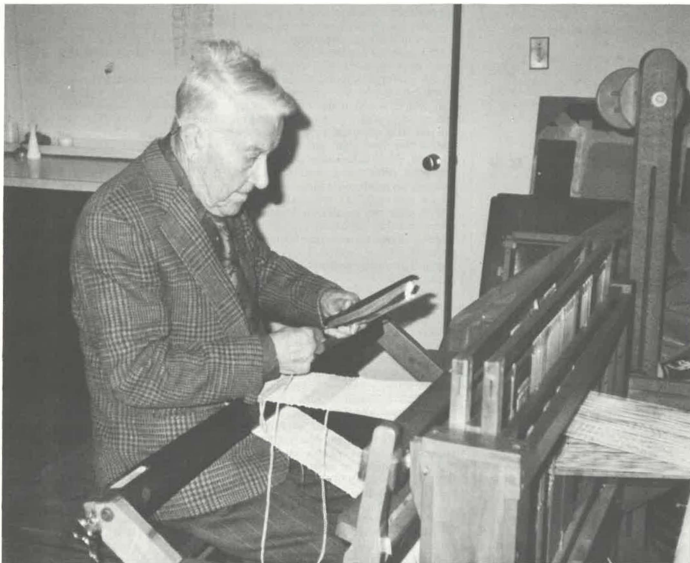
Resident of Heath Village, Hackettstown, N.J.: During retirement, old hobbies can be expanded or new ones learned [see p. 2].