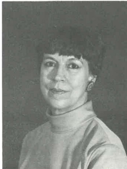
Mrs. Fox: Needed, adequate alternatives.

"But we have these in our community" you say? Yes, you probably do. But what small percentage of the need do they fill? With the steadily rising older