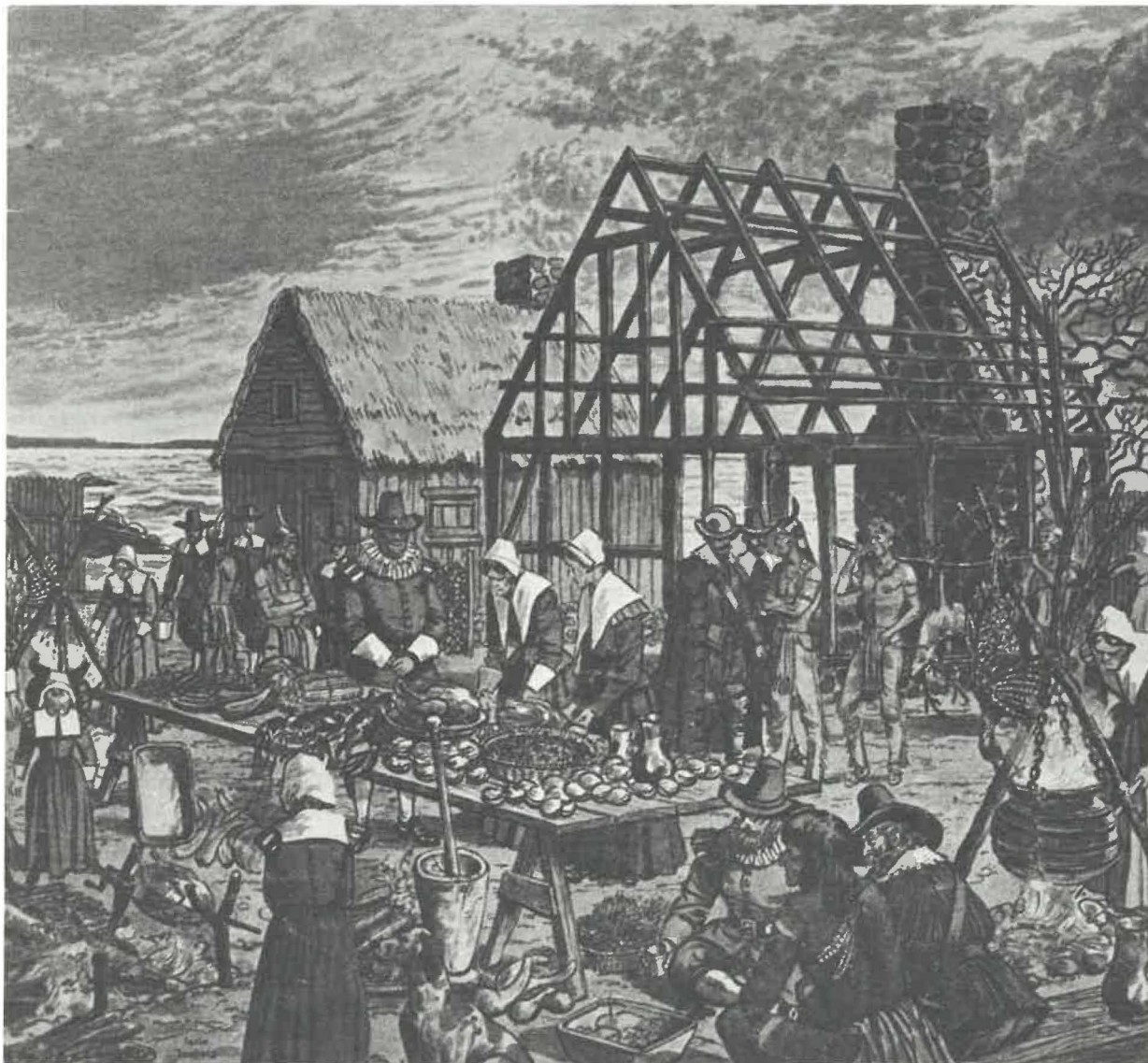
"The First Thanksgiving," by Leslie Saalburg: As we grow older, our thanksgivings should become deeper [see p.8].