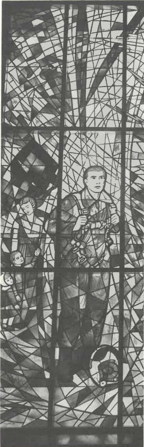
To maintain a Christian faith while serving in the armed forces can often be difficult.