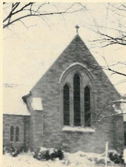
ST. PAUL'S CHURCH K St., N.W. WASHINGTON, D.C.