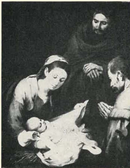
"Bethlehem brings . . . the spirit of love."

The message of Christmas is one of joy, of happiness of mankind getting more than it expected. A far greater danger than doing too much is making the observance too difficult to understand. I am a firm believer and supporter of trends within the church that make it respond to social issues like peace, justice, environ-