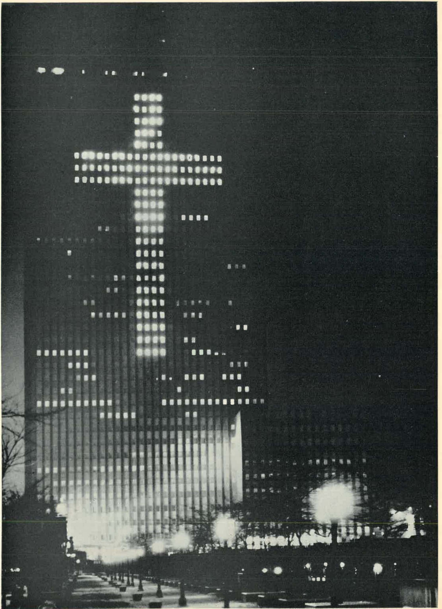
The Prudential Building, Chicago, at Christmas