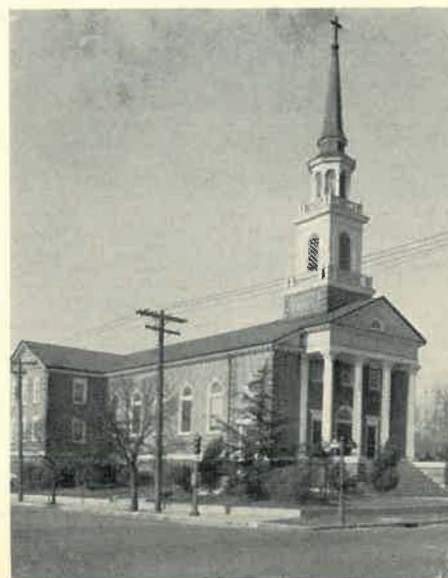
ST. LUKE'S CHURCH RICHMOND, VA.