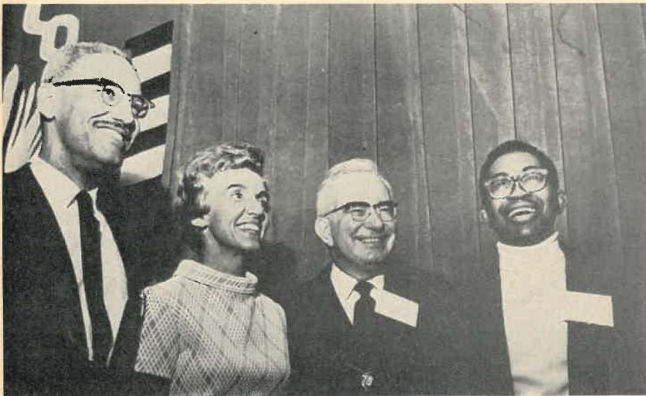
COCU's NEWEST OFFICERS

There is a third motivation for such a ceremony. It is to manifest to the world a new type of unity in Christ. However, I do not believe it could, because the Episcopal Church is fundamentally disjointed from other COCU churches by differing views of the sacrament of Holy Communion and of the orders which may preside at that service. Whereas the Anglican Communion believes the ministration of Holy Communion is a priestly function derived from a bishop's authority, the other COCU churches neither hold that it requires ordination to the priesthood nor that it is, basically, the act of a bishop. Whereas the Anglican Communion has traditionally regarded it as its center of inspiration and direction for ministry to the world, many of the other COCU churches do not. Whereas there is, within the Anglican Communion a "high" view of the intimate, material, and per-