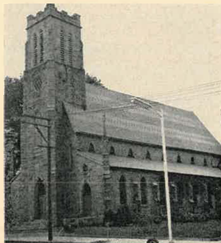
ST. JAMES' CHURCH DANBURY, CONN.