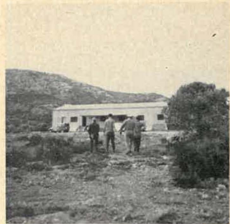
The youth center in Castellón