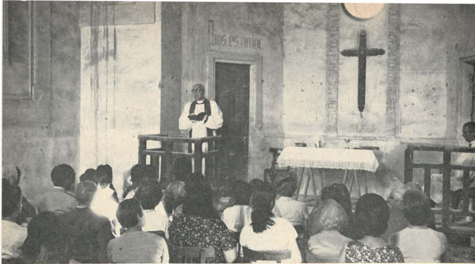
A celebration of Holy Communion at the church in Gigales