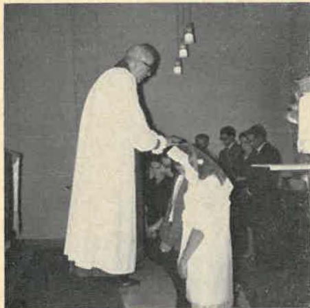
A nuptial blessing