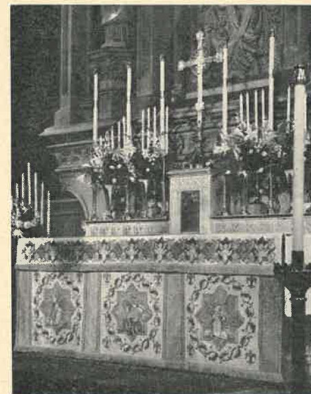
GRACE CHURCH NEWARK, N.J.