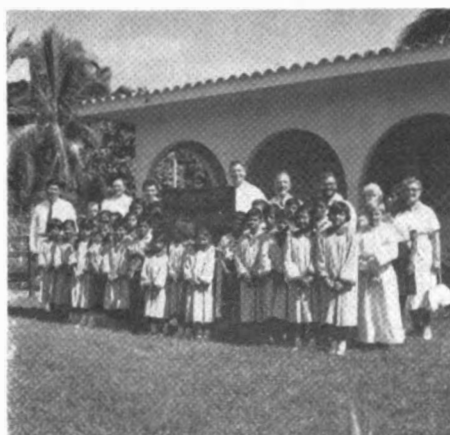
At HOLY CROSS CHURCH ACAPULCO, MEXICO