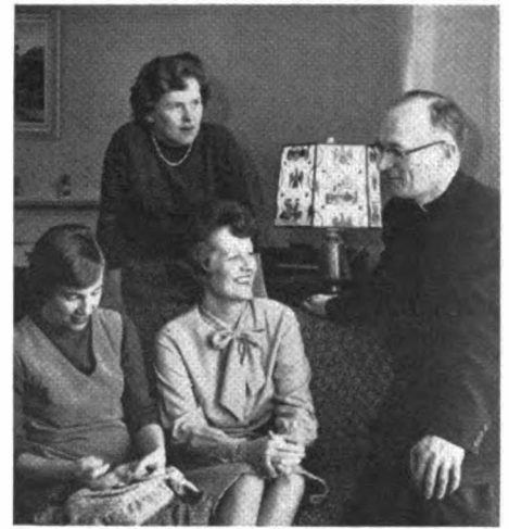
A Roman Catholic priest leads a house study group