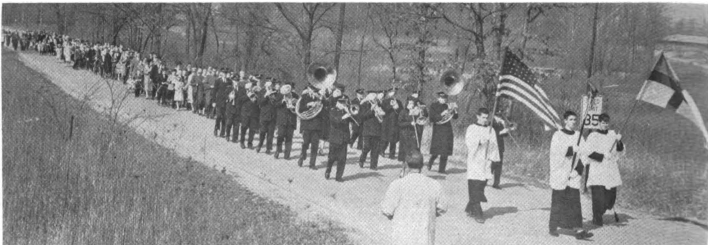
The Salvation Army Band leads the Palm Sunday procession

who have been encouraged and deeply affected by the ministry and direction that St. Stephen's has furnished. One of the five is now a teacher at the Virginia Seminary, one a minister in counseling and pioneering work at Oakland Uni-