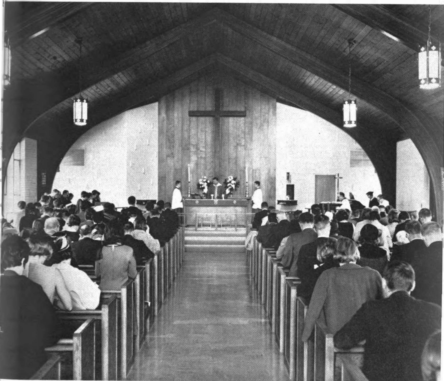
The nave and sanctuary of St. Stephen's Church, Troy, Mich.