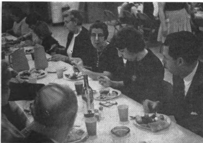
Syrian Orthodox meal and Eucharist

St. Stephen's is a liturgical movement parish, with all that that implies, making use of the proposed new liturgy and trying to involve people in meaningful corporate worship. An emphasis on preaching and the Lord's Supper is the direction now being taken by the rector and people of St. Stephen's Church.