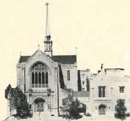
TRINITY CHURCH Tulsa, Oklahoma

Sun HC 8, 9:30, 11 (1S), MP 11; Daily ex Sat HC 8:15; Tues 12:10; Wed 5:30