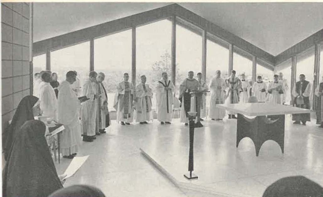
The St. Helena Convent is dedicated.

Representatives of Episcopal Religious orders; the Rt. Rev. Gray Temple, Bishop