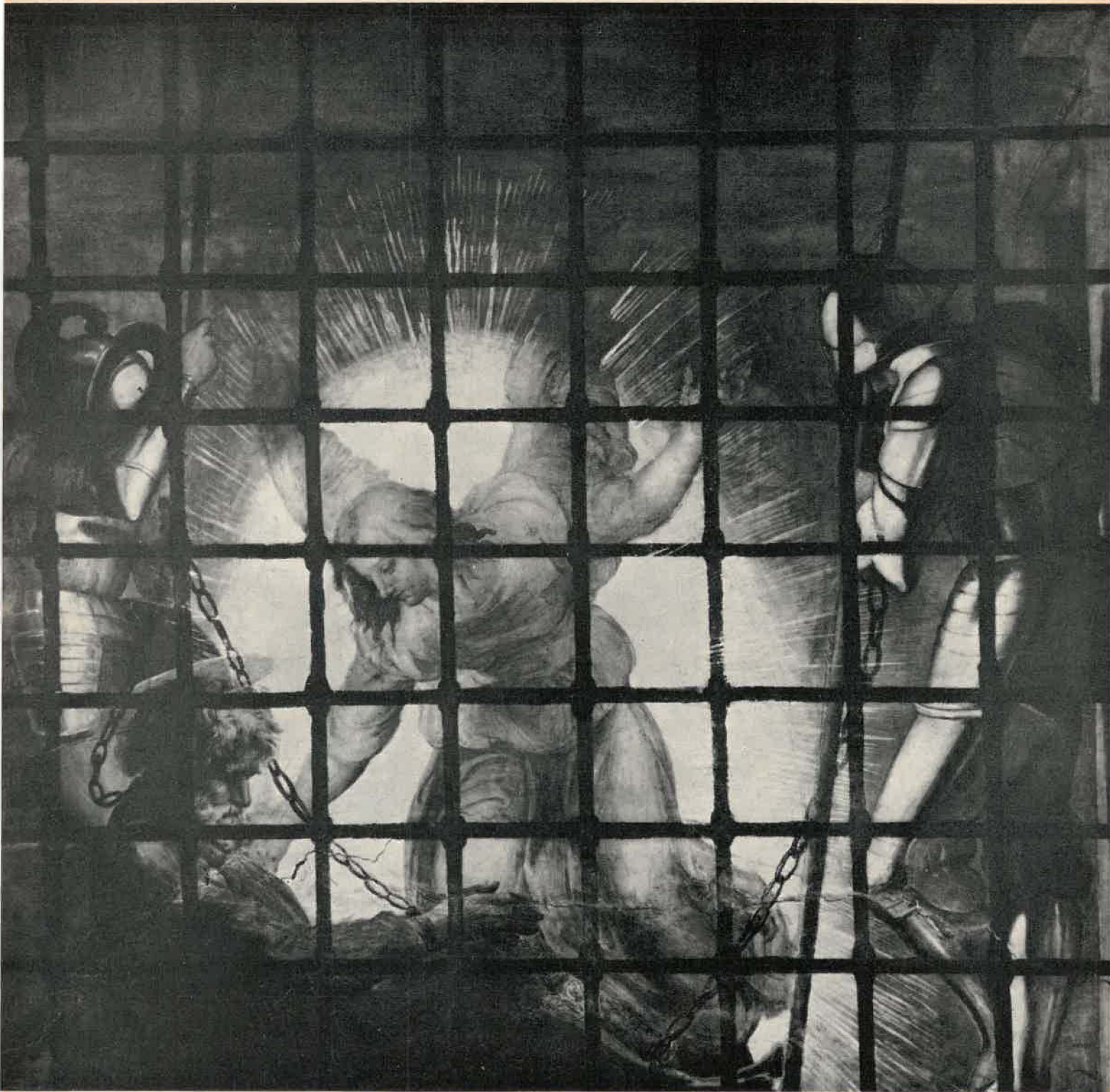
Raphael: St. Peter in Prison