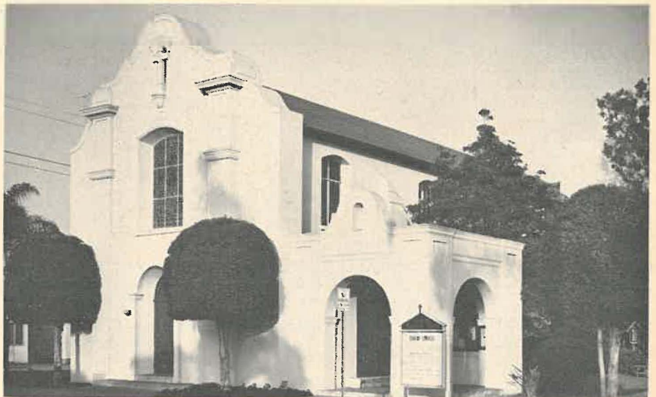
ALL SAINTS' CHURCH SAN DIEGO, CALIF.

VANCOUVER, B. C. CANADA ST. JAMES' Gore & Cordova Sun Masses 7:30, 8:30, 9:30, 11, Sol Ev 7:30; Daily Mass 7:15; C Sat 7 & 8:30 & by appt