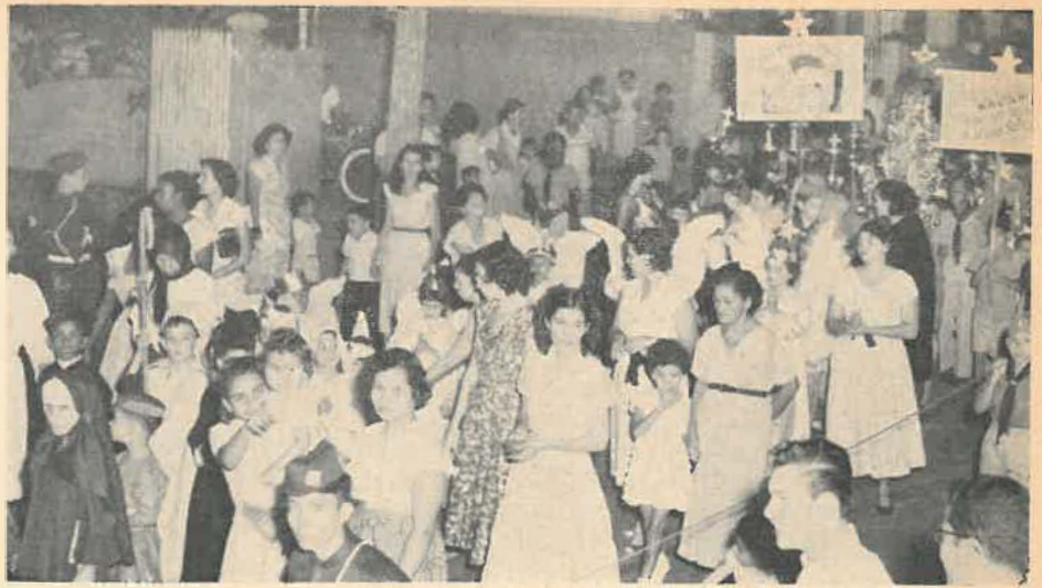
The Church can win Puerto Ricans by the same hard grind it wins Anglo-Saxons.*