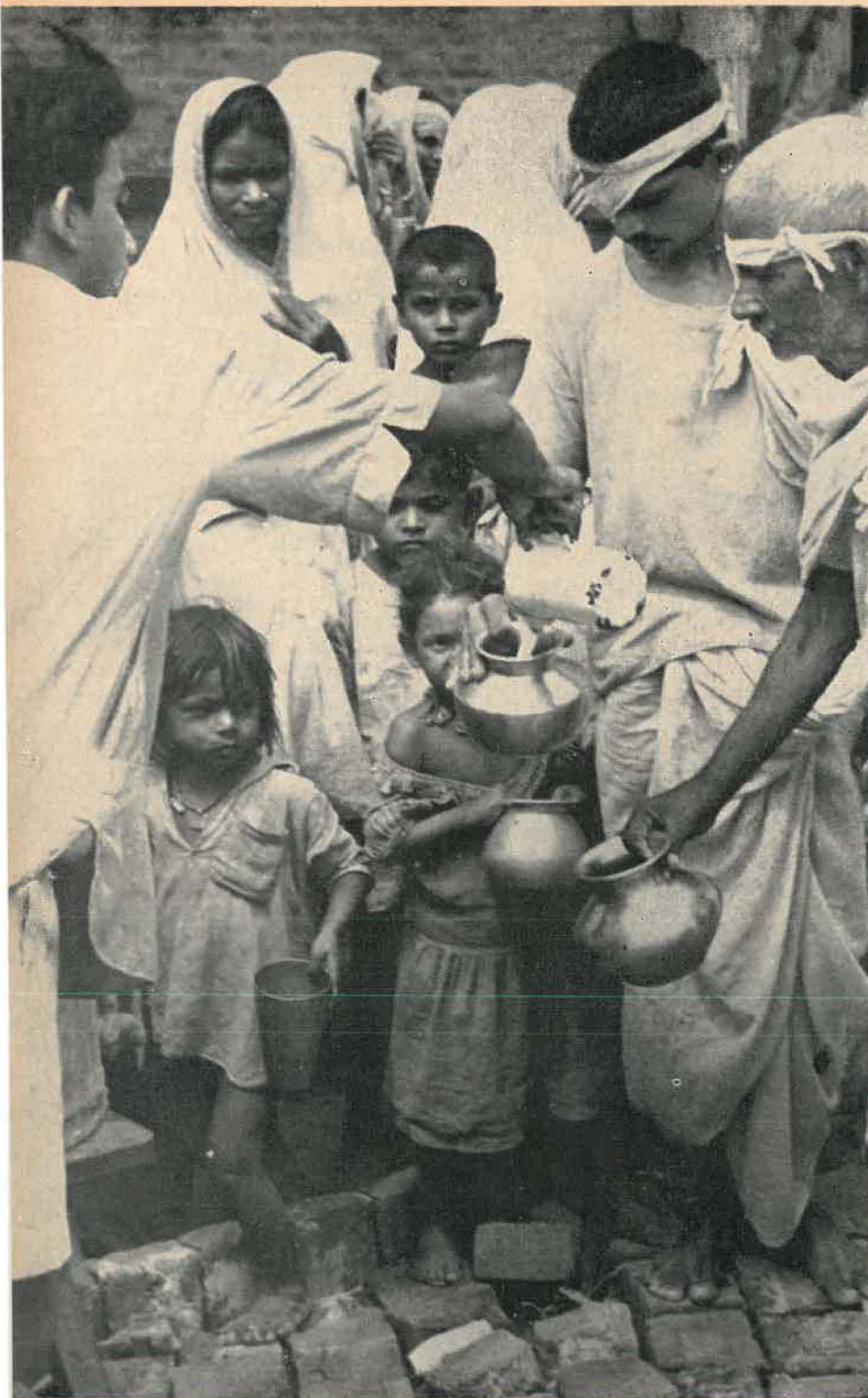
Mission hospital patients near Bombay, in poverty-stricken India, receive milk from Church World Service. How can a new Church, in India, be judged on a nylon-carpeted Convention floor as though it were in our identical cultural and religious tradition?