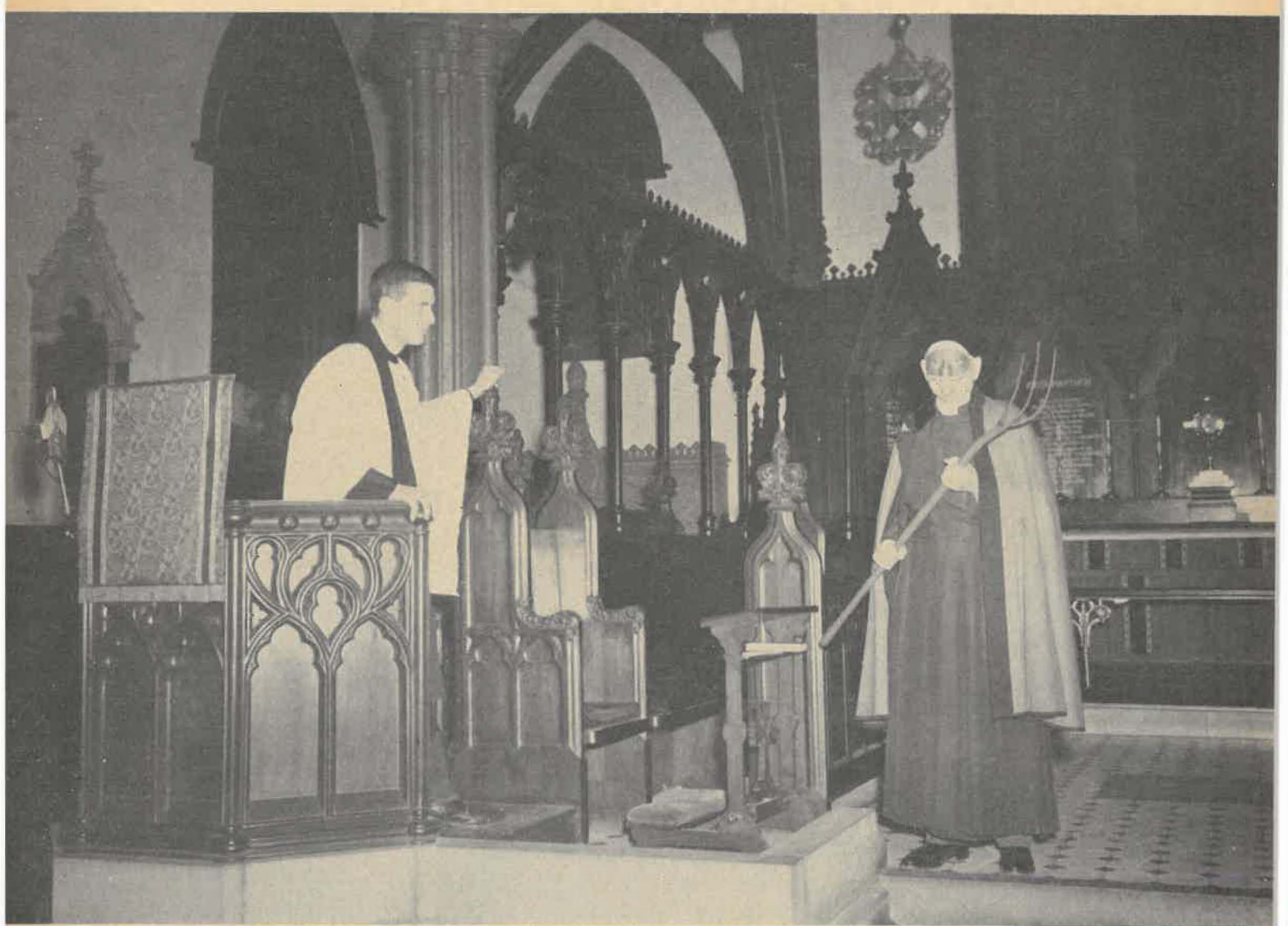
Unholy Glee turned up in New London, Conn. [p. 19]