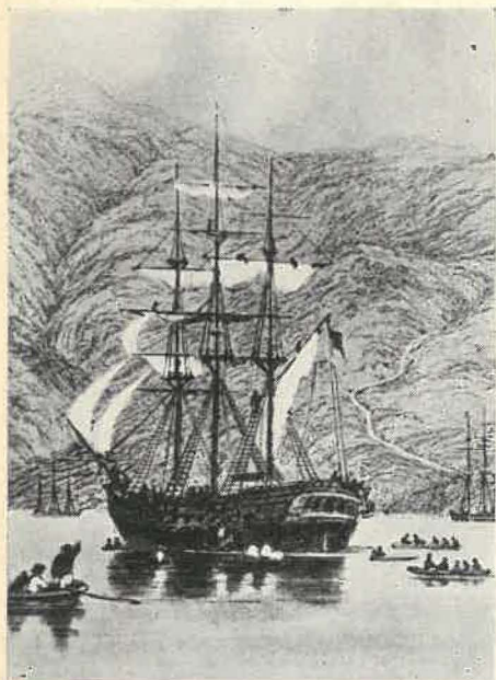
The ship "Cressy" was one of four which brought first settlers to a New Zealand Province in 1850.