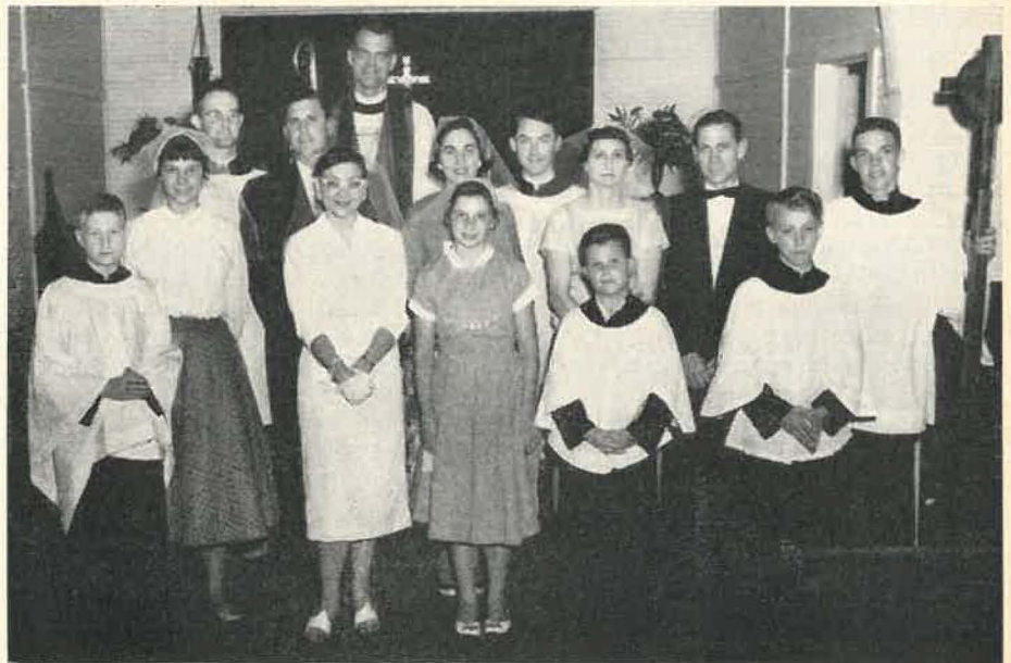
A good-sized confirmation class in many parishes, this class of eight was phenomenal at St. Stephen's Church, Alva, Okla., where it increased the communicant strength 27%! Bishop Powell is at the back.

The Episcopal Advance Fund, a capital drive in the diocese of Ohio, was brought to a successful conclusion as of June 25th. The drive, authorized by the convention of the diocese in January and formally inaugurated with a special convention on April 30th, was directed toward four main objectives: $700,000 for an expanded program for diocesan missions; $300,000 for a new diocesan headquarters; $100,000 for a conference center; and