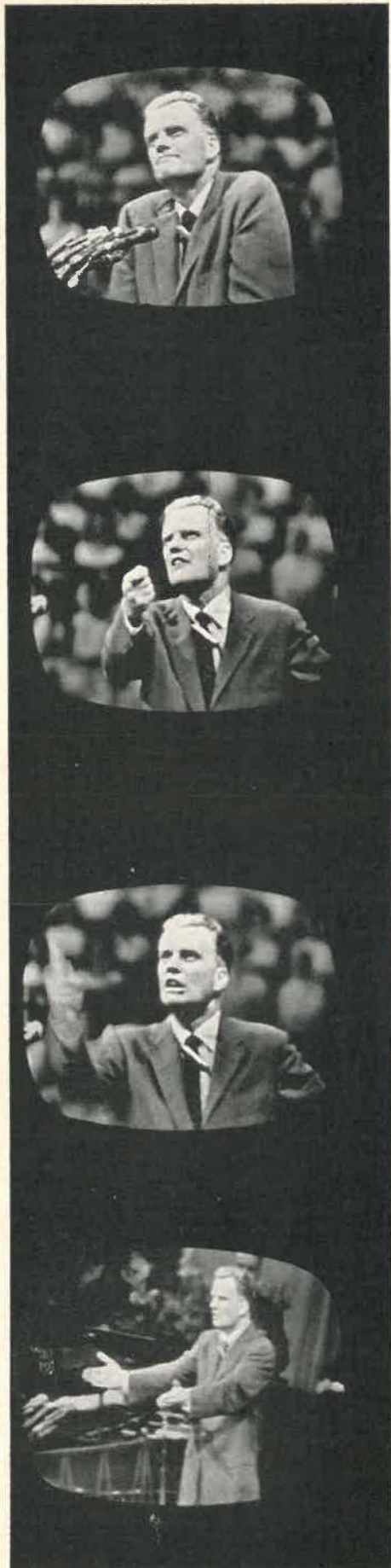
Photos of Billy Graham from the telecast over the American Broadcasting Company Network on June 15th of Graham's New York Crusade. See Cover.

who sits beside him while Dr. Graham or one of his 12 assistants talks to them. They are urged to attend counseling sessions held before each evening's service, and to follow this proposal: To read the Bible and pray daily; witness for Christ at every opportunity, and join some Church immediately.