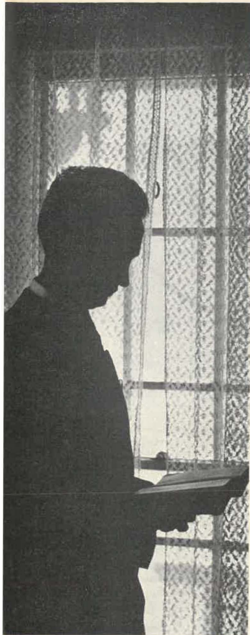
THE RECTOR must be free to do God's work.

who would be on hand at all times to relieve the rector, in effect, of the obligation "to serve tables."