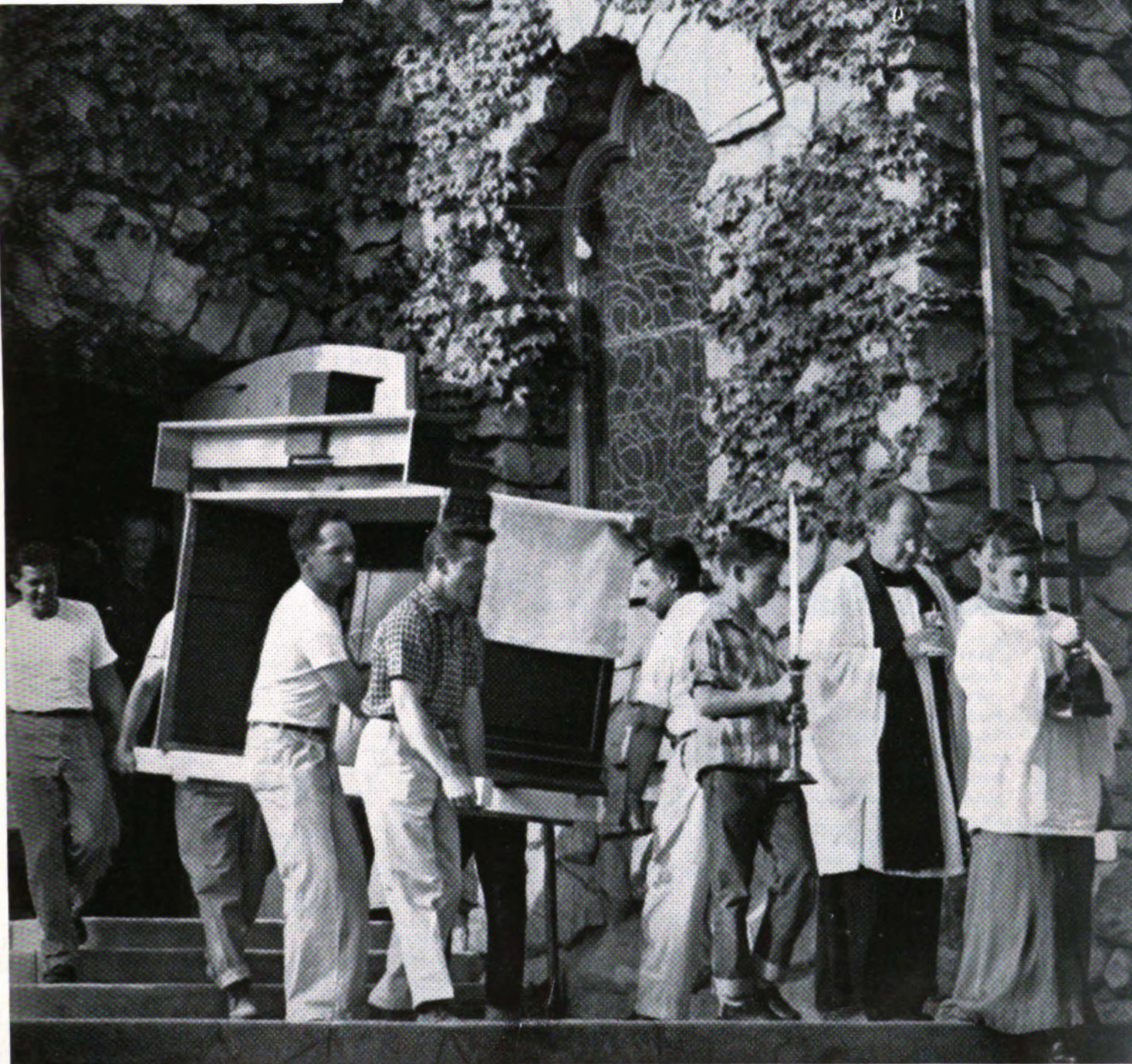
ST. LUKE'S, La Crescenta, Calif.: The altar was carried from the church [p. 4].