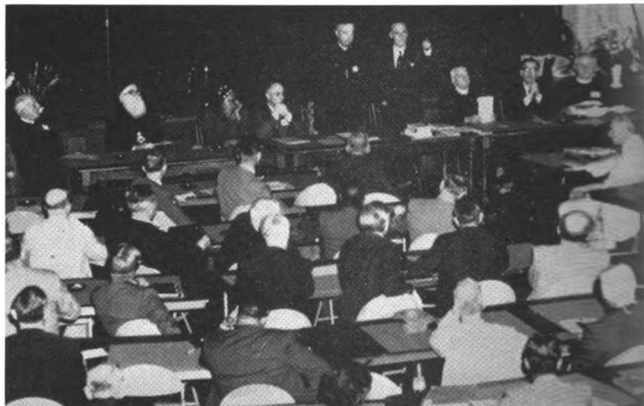
CENTRAL COMMITTEE SESSION*

LIBERAL COMMISSIONS are available to Church groups selling The Living Church — subscriptions or bundle plan. Write to Circulation Department, The Living Church , 407 E. Michigan St., Milwaukee 2, Wis.