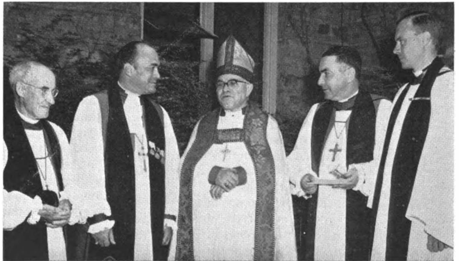
PILGRIMS* A great past, a great future.