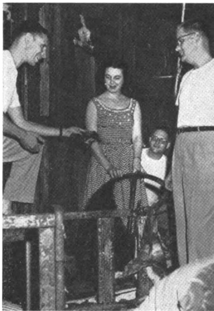
FIRE AT SEWANEE* Well-crisped shoe.

Sleepless men and women of Woodland the next day organized a clean-up