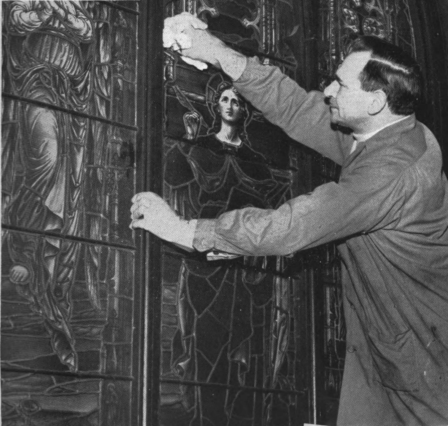
AT ST. LUKE'S, WINNIPEG: Everybody cleaned house [p. 5].