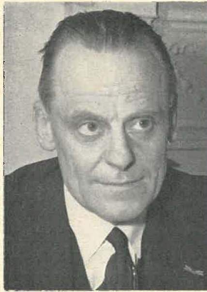
DR. W. A. VISSER 'T HOOFT The spirit, if not the letter.