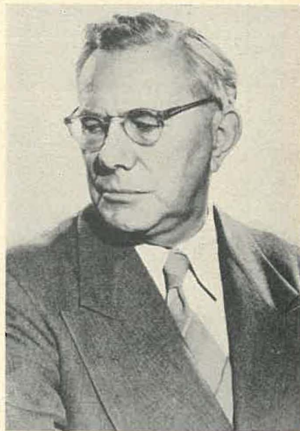
PAUL TILlich The power and the form.

Professor Tillich continues his service to many of our contemporaries in these pages by again stressing the primacy of ontology for the philosophical and theological disciplines. His characteristic references to depth psychology and dynamism are also present. In fact, the latter, as manifested in the dialectical tension between being and non-being, furnishes the only proper terms with which love and power can be described.