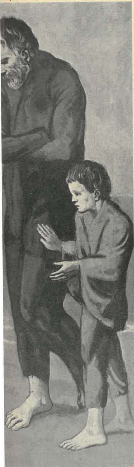
PICASSO. not lost his religiousness.

Washington, D. C., Chester Dale Collection (Loan)