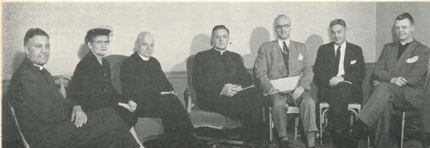
HOSPITAL ASSEMBLY OFFICERS*