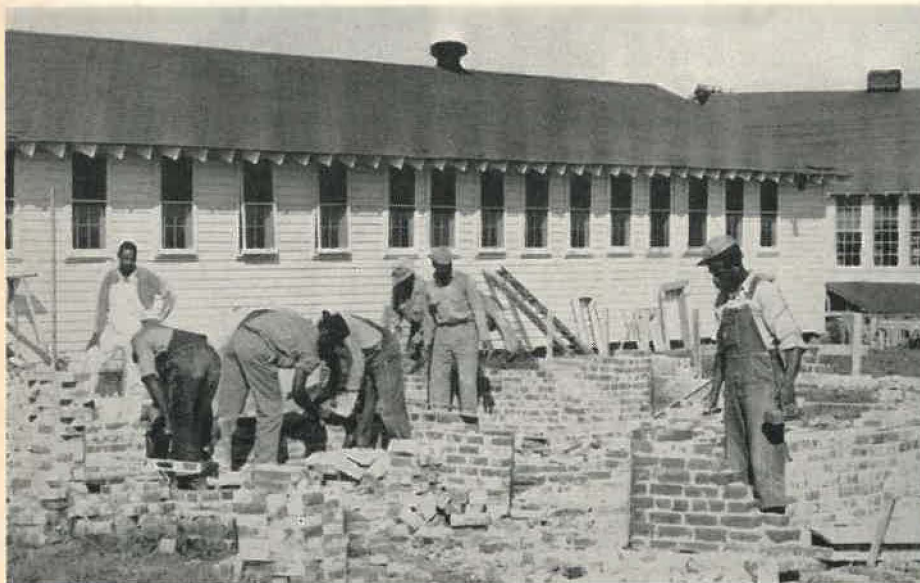
AID IN SIGHT FOR OKOLONA* Result of campaign.

auditorium at St. Augustine's College, North Carolina.