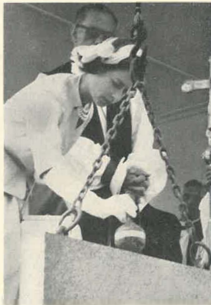
QUEEN ELIZABETH* Wood, silver, and stone.

The ceremony, presided over by Archbishop Owen, Primate of New Zealand, was attended by leaders of other major Communions as well as by prominent