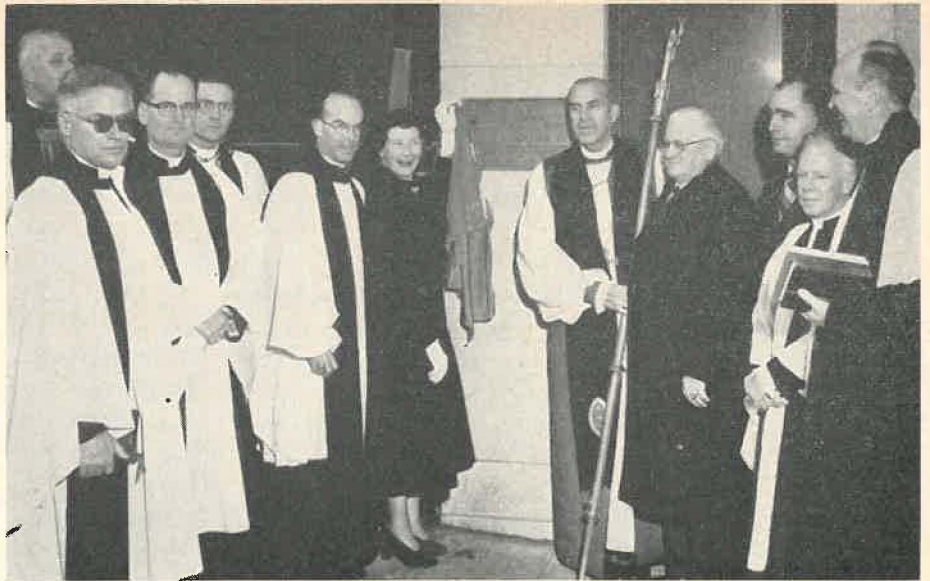
CALIFORNIA COMMEMORATES CENTURY Scene of First Service.*

TUNING IN: ¶Some dioceses are divided into convocations, which are territorial areas designed to expedite the work of the diocese. In some of these dioceses it has been customary to include the colored work in a convocation of its own. ¶St.