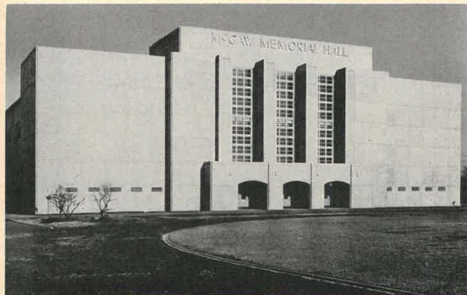
SITE OF WORLD COUNCIL ASSEMBLY* A close view of contrasts.

In addition, there will be delegations from at least two countries behind the Iron Curtain, Czechoslovakia and Hungary. Not only will these contribute the distinctive viewpoint of Christians living under Communist governments, but their presence is likely to provoke comment, and perhaps misunderstanding, by the secular press. It will be important