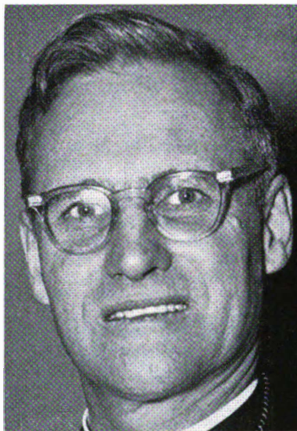
BISHOP STOKES 200 waited in the cold.

esan authorities can be of great assistance in bringing this about.