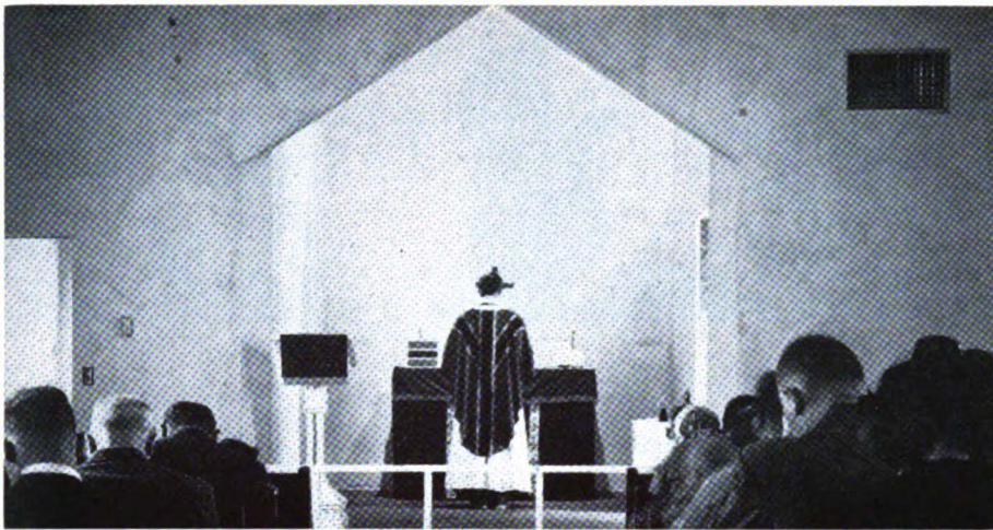
ST. MARY'S, HOLLY An old coffee pot was filled with snow.