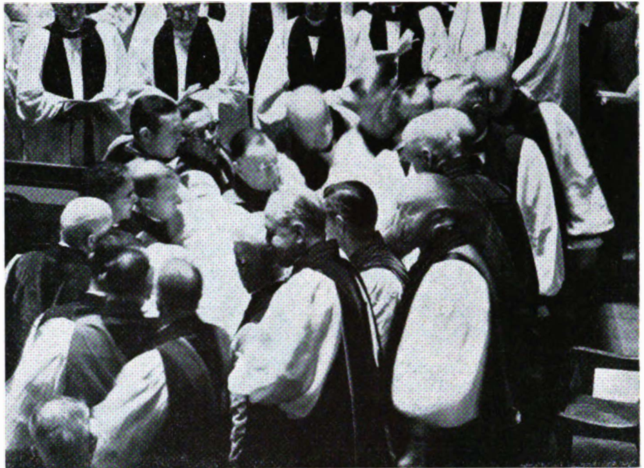
BISHOP STOKES' CONSECRATION, LAYING ON OF HANDS Almost a double formation.

"First, these benefits are closely related to the total earnings of the clergyman during the 12 or 24 month period beginning January 1, 1955. Therefore, those planning to reënter active, limited service on or near that date should seek to make as much salary as possible during this period. Bishops and other dioc-