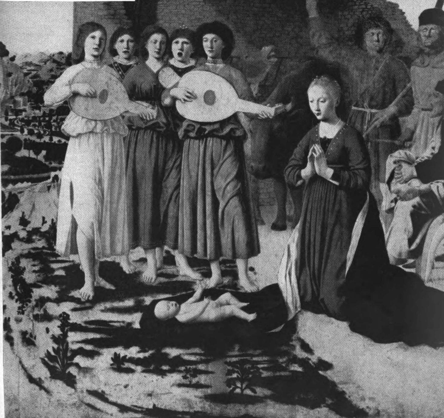
NATIVITY: Silent shepherds, singing angels [p. 18].