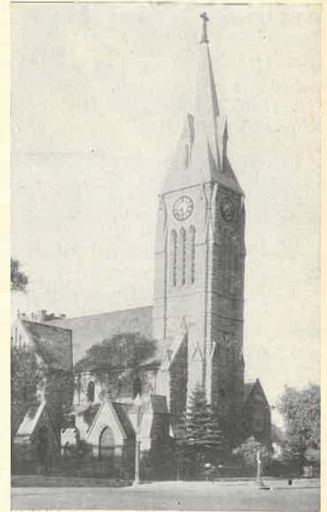
LARAMIE CATHEDRAL. Amid rustic churches.

TUNING IN: ¶A program of missionary, educational, and social work (including world relief) is adopted by General Convention every three years. Carrying out the program, as revised to make expenditures fit with income, is the job of the National