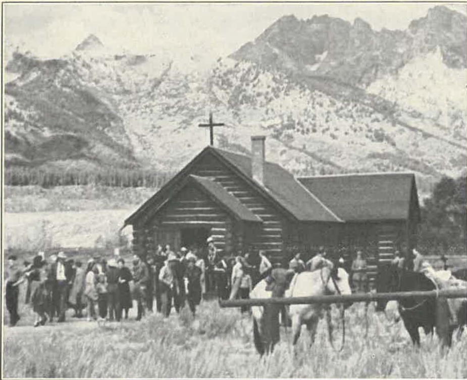
CHAPEL OF THE TRANSFIGURATION in a valley under a shadow.