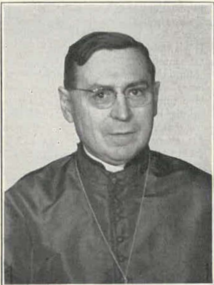
BISHOP STURTEVANT: For episcopal assistance, unanimous approval.

Changes recommended in Canon 46 provided that the same body in the par-