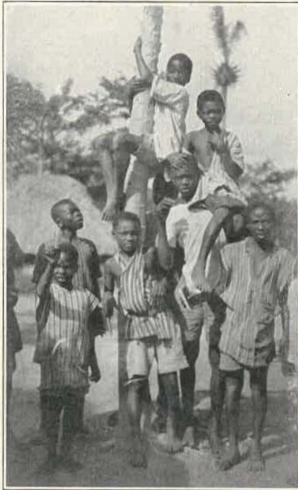
LIBERIAN school boys. The enrollment was up.

"The time has come when their fellow Christians abroad must give full support