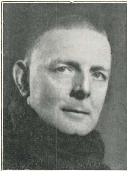
DOM GREGORY DIX: Found in Africa, his life and his death.