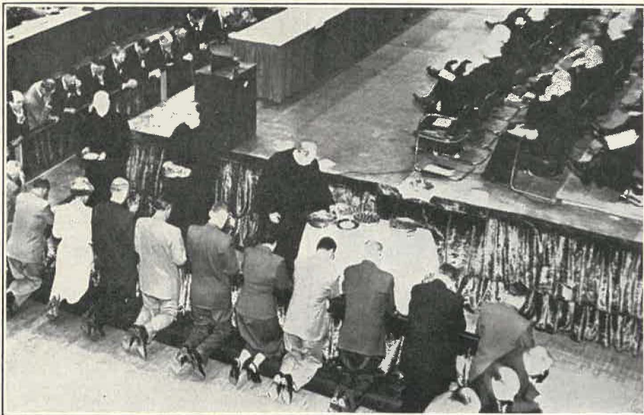
DELEGATES receive Holy Communion at Methodist Conference.

✓ Adopted a majority report permitting unordained student pastors to administer