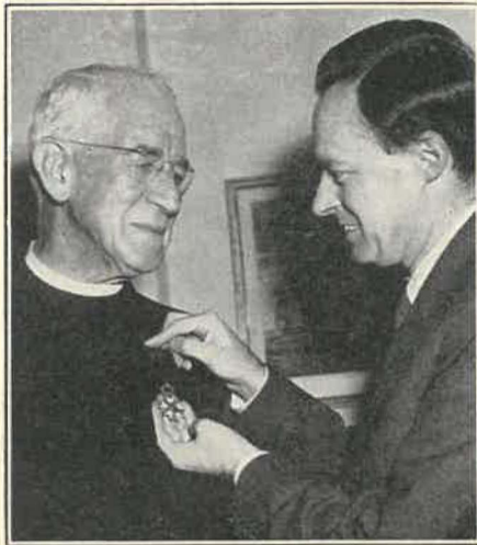
New York Daily News