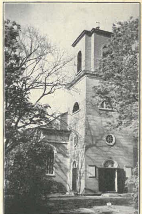
CHRIST CHURCH CAMBRIDGE, MASS.