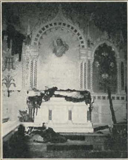
ST. PAUL'S, MILWAUKEE: Altar scorched, dossal destroyed. . . .