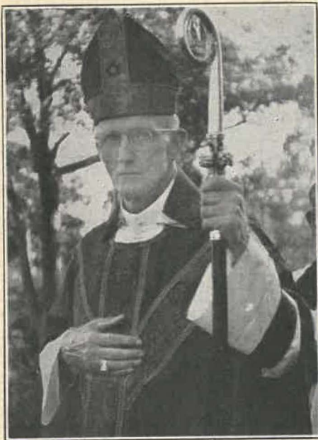
THE METROPOLITAN: Bulls and garlands.

"... with feelings of great joy, we offer you a hearty welcome. We take this opportunity to express through you our gratitude to the SPG, London, for its continued interest in us and prayers for us, especially during the difficult days that we passed through during the last two years. We earnestly hope that the General Council will take steps to constitute this area