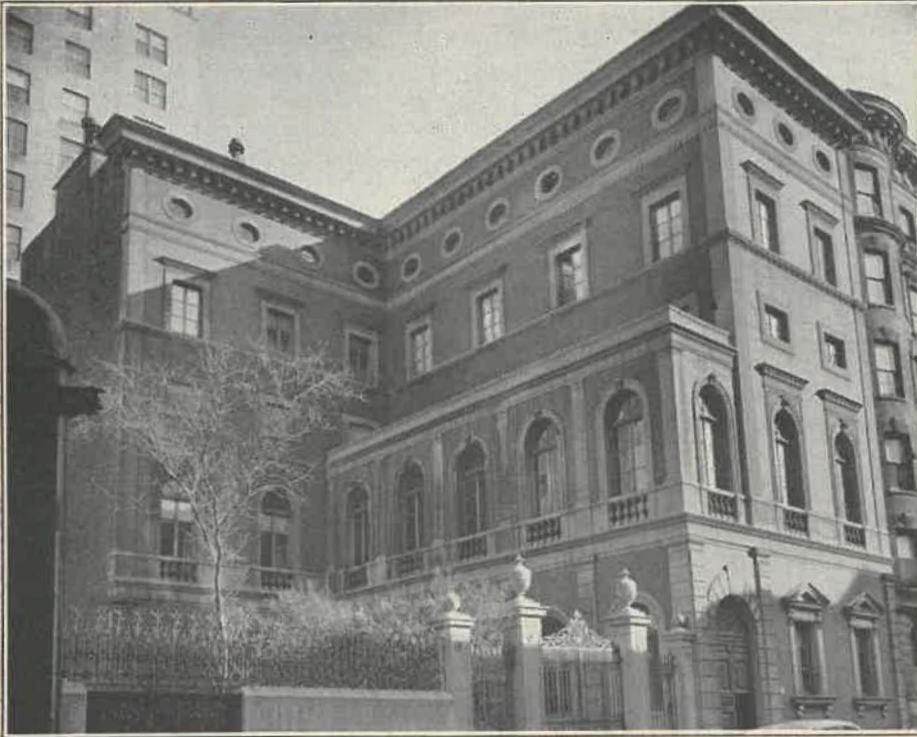
THE FABBRI MANSION: To promote spiritual retreats.