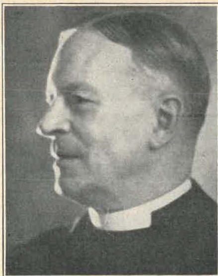
BISHOP LITTELL: Honored on 50th anniversary in priesthood.

Some 300 Eastern Orthodox and Anglicans joined Sunday, December 4th, in a requiem for those members of the Eastern Orthodox Churches who fell in