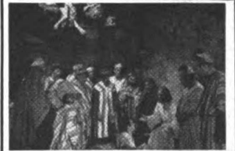
"Man of Faith"