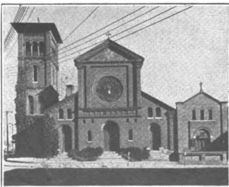
ST. PETER'S CHURCH SALISBURY, MD.