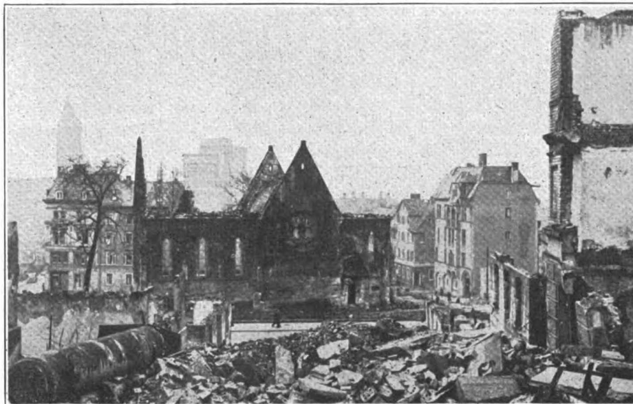
ANGLICAN CHURCH IN GERMANY: The ruined shell of the church in Stuttgart stands in the midst of rubble in the blasted city. The church was under the jurisdiction of the Bishop of London, who before the war was in charge of 87 Anglican clergy ministering in North and Central Europe.

Dr. Fisher's statement was endorsed by Bernard Cardinal Griffin, Roman