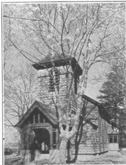
GRACE CHURCH MASSAPEQUA, L. I., N. Y.