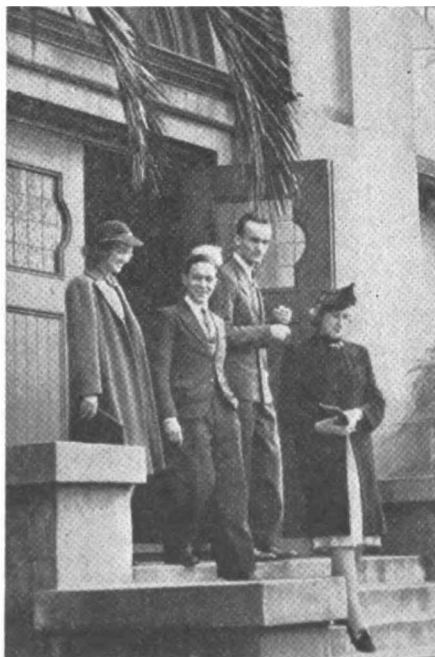
Cut from Forth.