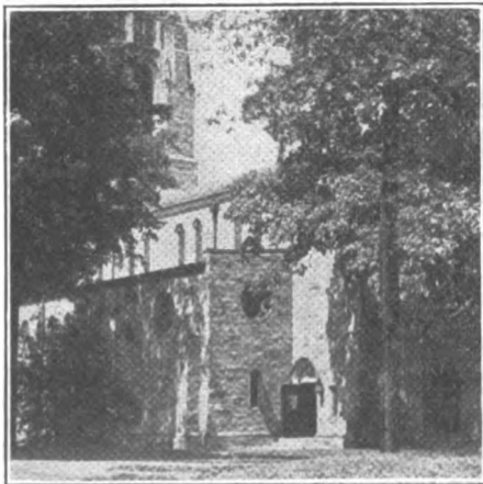
ST. PAUL'S CHURCH WINSTON-SALEM, N. C.