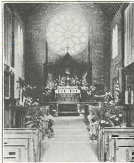
ST. PAUL'S CHURCH GLEN COVE, L. I.