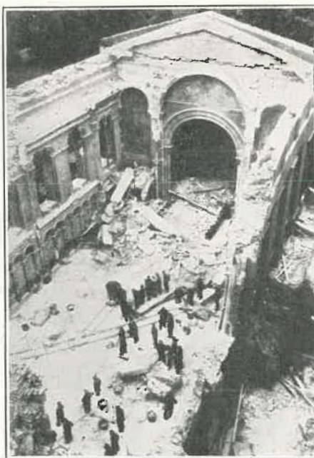
GUARDS CHAPEL: Many casualties resulted when this noted London church was demolished by robot bombs during a service [L. C., July 16th].

"I deeply appreciate the compliment that your church has paid me in installing the stained glass window in my honor," she wrote. "The fact that it is composed of