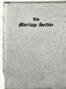
No. 41—White Leatherette

No. 47DC—Same style as No. 47 with the words "District of Columbia" printed in the marriage certificate. Price, $3.50.