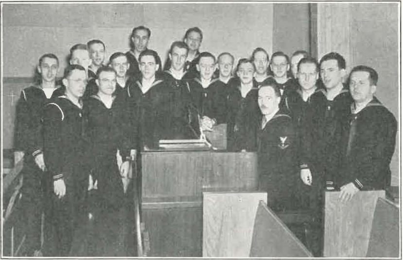
CHAPLAINS' ASSISTANTS: These men at Sampson, N. Y., Naval Training Station are candidates for Specialist (W) rating. They will serve as chaplains' assistants in the Navy ashore and afloat.