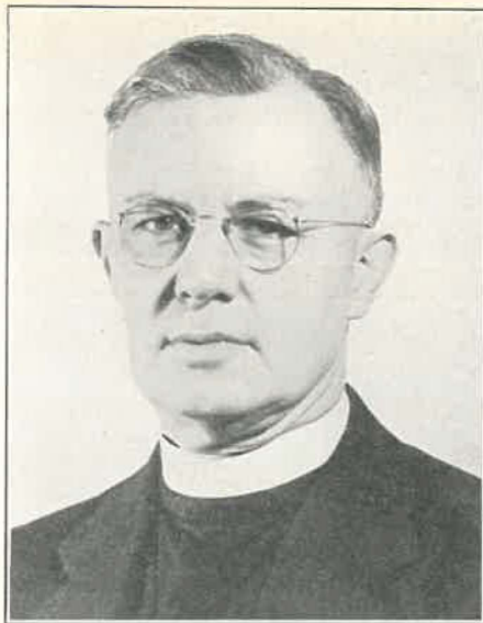
BISHOP STONEY: A hair-raising screen shocker?

Opposite corners are as far New York and Chicago, but imilar transportation facilities. County, the largest in Texas, square miles, 1,000 more than ut. The county has 6,000 people, 4,000 live in Alpine, the county : man was 38 miles from his until the building of a road : to within four miles. Another