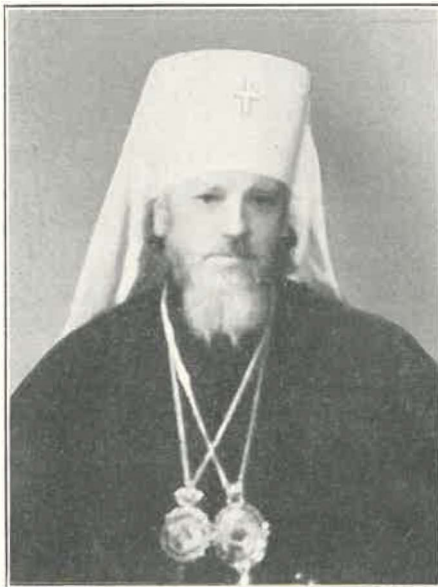
METROPOLITAN ALEXEI: Appointed Acting Patriarch of Moscow and All Russia.

The Holy Synod of the Russian Orthodox Church has appointed Metropolitan Alexei of Leningrad and Novgorod as provisional successor to Metropolitan Sergei, Patriarch of Moscow and all Russia,