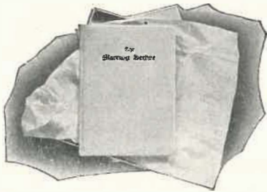
No. 47—White Morocco

No. 47—Bound in beautiful genuine white Morocco leather, with round corners, gilt edges, enclosed in white box. Price, $3.50.