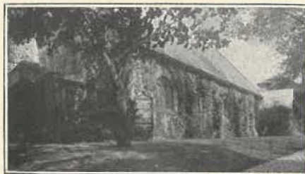
ST. MARK'S CHURCH MILWAUKEE, WIS.