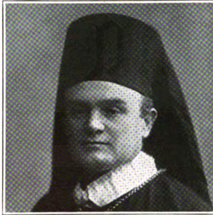
BISHOP GORAZD: Ecumenical statesman and martyr for democracy.

Bishop Gorazd was seized and executed by the Nazis on the charge of harboring some of the men responsible for the assassination of Reinhard Heydrich. Doubtless the charge was true. He was not the kind of man to hesitate for reasons of personal safety when the opportunity presented itself of doing a good turn for God and country. It might also be added that the Metropolitan Dositei, by latest report, has been badly maltreated by the Nazis in Serbia and cast into a concentration camp. These men today claim our respect for their high courage. Someday, they