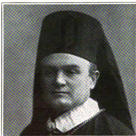
BISHOP GORAZD: Ecumenical statesman and martyr for democracy.

Bishop Gorazd was seized and executed by the Nazis on the charge of harboring some of the men responsible for the assassination of Reinhard Heydrich. Doubtless the charge was true. He was not the kind of man to hesitate for reasons of personal safety when the opportunity presented itself of doing a good turn for God and country. It might also be added that the Metropolitan Dositei, by latest report, has been badly maltreated by the Nazis in Serbia and cast into a concentration camp. These men today claim our respect for their high courage. Someday, they